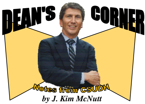
Dean, Osher Lifelong Learning Institute College of Extended & International Education CSUDH

reetings Omnilore members! January 1<sup>st</sup> marks the official start of the year. However, after 25 years working in higher education, the Fall season marks the beginning of the new year for me. This is my favorite time of year. The sun sets earlier, evenings get crisper, college and pro football is underway. More importantly, Fall is clearly indicated by the large number of university students hunting for parking spaces and crowding the halls and