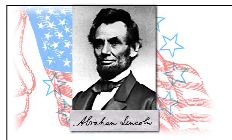
February 12, 1809—April 54, 1865 16th President

The key thing, in our view, is to have two people concur; two views will surely help if not entirely eliminate the problem. We believe that this process will significantly reduce complaints about the quality of the common reading. Also, it is hoped that coordinator training will emphasize to both new and 'old' coordinators that a common reading does not always have to be the "core" of the class operation.