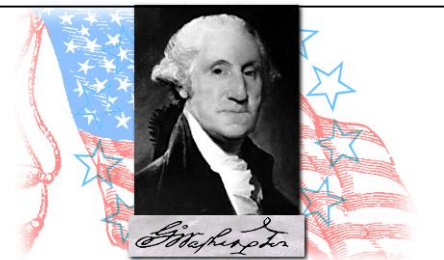
February 22, 1732—December 14, 1799

There are many excellent S/DGs that do not use a core text, but many Omnilore members strongly prefer courses using a book. A determination is made during the planning of each course as to how much time to allot to book discussions, taking into account the subject matter and the number of class members. It is not within the purview of the CC to tell coordinators or class members how to run their meetings. But it